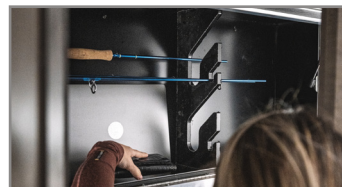
Large hidden storage for fishing poles or hunting rifles