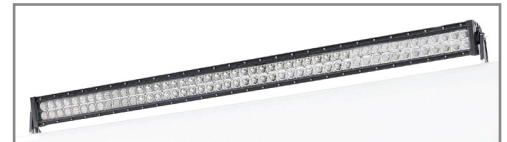
Front & rear LED light bars assist in loading & unloading