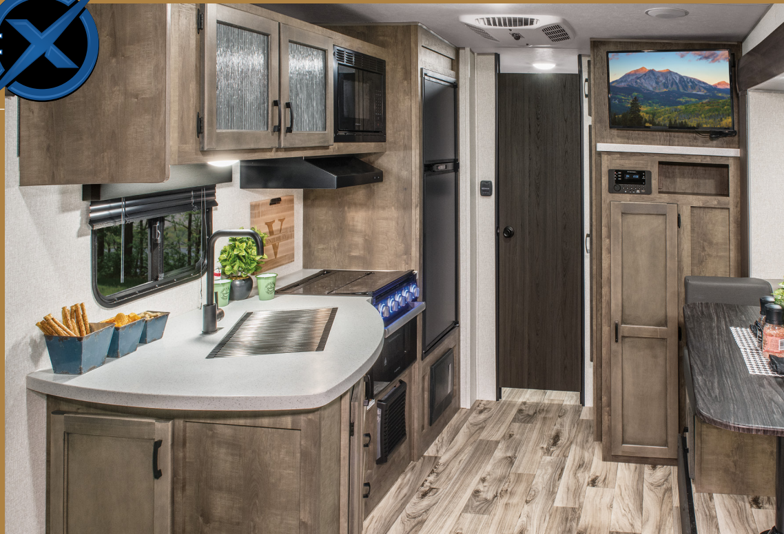
Sonic X interiors include solid wood cabinets with roller ball bearing drawer guides, a large undermount stainless steel single bowl sink, and two interior speakers.