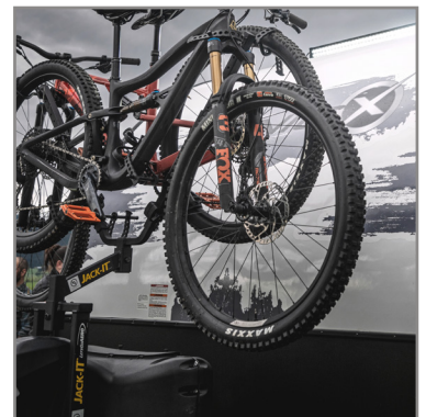
Front-mounted bike rack holds up to two bikes