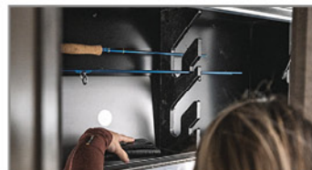
Large hidden storage for fishing poles or hunting rifles