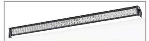
Front & rear LED light bars assist in loading & unloading